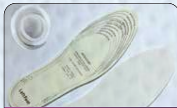
footwear non woven