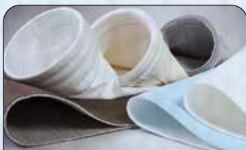
Nonwoven Filtr ation